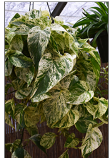
Marble Queen Golden Pothos foliage