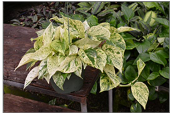
Marble Queen Golden Pothos in full

This is an herbaceous evergreen houseplant with a spreading, ground-hugging habit of growth. This plant can be pruned at any time to keep it looking its best.