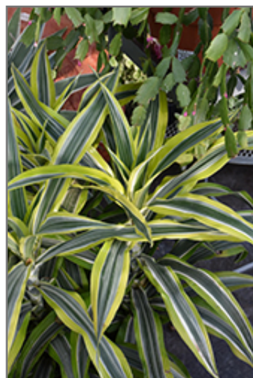
Lemon Lime Dracaena