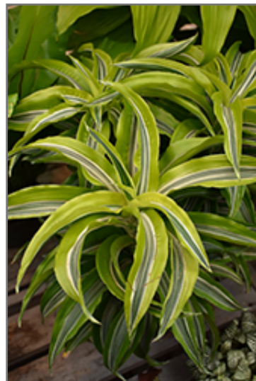
Lemon Lime Dracaena foliage

When grown indoors, Lemon Lime Dracaena can be expected to grow to be about 5 feet tall at maturity, with a spread of 24 inches. It grows at a medium rate, and under ideal conditions can be expected to live for approximately 10 years. This houseplant performs well in both bright or indirect sunlight and strong artificial light, and can therefore be situated in almost any well-lit room or location. It does best in average to evenly moist soil, but will not tolerate standing water. The surface of the soil shouldn't be allowed to dry out completely, and so you should expect to water this plant once and possibly even twice each week. Be aware that your particular watering schedule may vary depending on its location in the room, the pot size, plant size and other conditions; if in doubt, ask one of our experts in the store for advice. It is not particular as to soil type or pH; an average potting soil should work just fine.