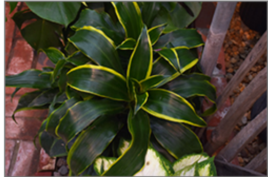
Dorado Dracaena foliage

When grown indoors, Dorado Dracaena can be expected to grow to be about 4 feet tall at maturity, with a spread of 24 inches. It grows at a medium rate, and under ideal conditions can be expected to live for approximately 10 years. This houseplant performs well in both bright or indirect sunlight and strong artificial light, and can therefore be situated in almost any well-lit room or location. It does best in average to evenly moist soil, but will not tolerate standing water. The surface of the soil shouldn't be allowed to dry out completely, and so you should expect to water this plant once and possibly even twice each week. Be aware that your particular watering schedule may vary depending on its location in the room, the pot size, plant size and other conditions; if in doubt, ask one of our experts in the store for advice. It is not particular as to soil type or pH; an average potting soil should work just fine.