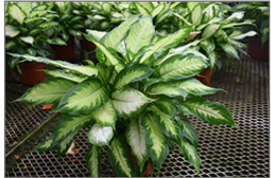
Camille Dieffenbachia in full

This is an herbaceous evergreen houseplant with an upright spreading habit of growth. Its relatively coarse texture stands it apart from other indoor plants with finer foliage. This plant should not require much pruning, except when necessary to keep it looking its best.