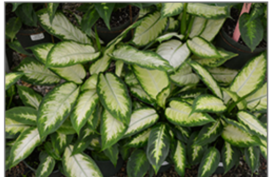
Camille Dieffenbachia foliage