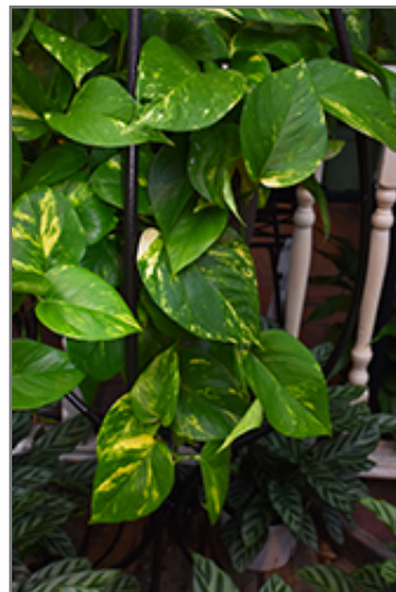
Golden Pothos foliage

When grown indoors, Golden Pothos can be expected to grow to be about 5 feet tall at maturity, with a spread of 24 inches. It grows at a fast rate, and under ideal conditions can be expected to live for approximately 10 years. This houseplant performs well in both bright or indirect sunlight and strong artificial light, and can therefore be situated in almost any well-lit room or location. It does best in average to evenly moist soil, but will not tolerate standing water. The surface of the soil shouldn't be allowed to dry out completely, and so you should expect to water this plant once and possibly even twice each week. Be aware that your particular watering schedule may vary depending on its location in the room, the pot size, plant size and other conditions; if in doubt, ask one of our experts in the store for advice. It is not particular as to soil type or pH; an average potting soil should work just fine. Be warned that parts of this plant are known to be toxic to humans and animals, so special care should be exercised if growing it around children and pets.