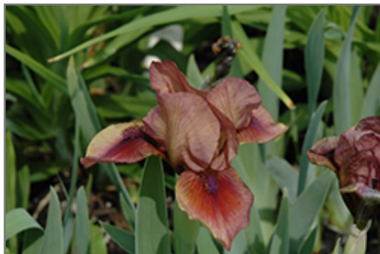
Cimarron Rose Iris flowers

This exotic iris produces copper-brown blooms with purple beards; a captivating addition to the perennial border; also excellent massed in groupings in the garden; will re-bloom later in summer