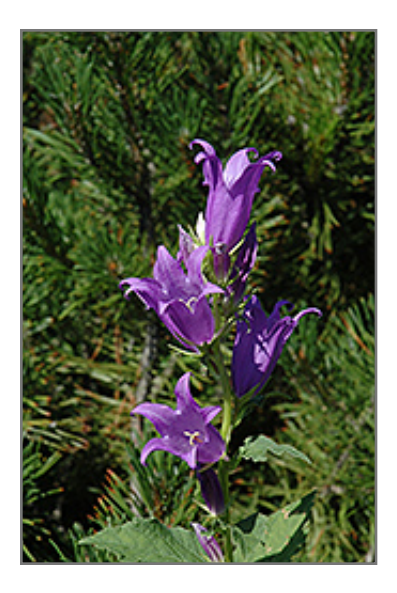
Spotted Bellflower flowers