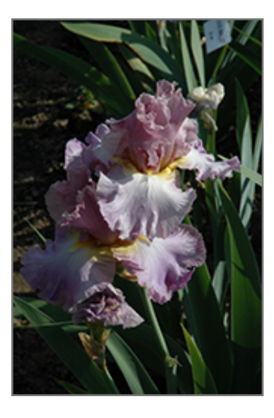
Burst Of Joy Iris flowers

This outstanding variety produces rosy-amethyst blooms with yellow shoulders and gold beards; a stunning addition to the perennial border; also excellent massed in groupings in the garden; will quickly form dense colonies