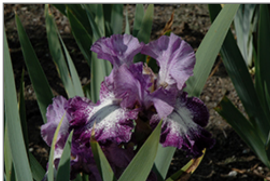
Broadband Iris flowers

An exquisite iris presenting lavender standards with contrasting white falls that are edged and spotted with deep violet; a stunning addition to the perennial border; also excellent massed in groupings in the garden; will quickly form dense colonies