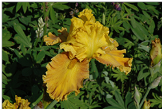
Blazing Beacon Iris flowers