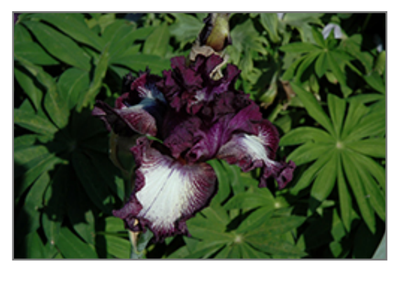
Blackberry Tease Iris flowers