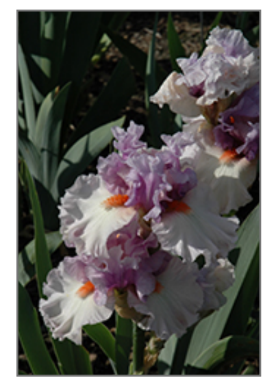
Belgian Princess Iris flowers

An exquisite iris producing lavender-pink ruffled blooms with cream falls and orange beards; a stunning addition to the perennial border; also excellent massed in groupings in the garden; will quickly form dense colonies