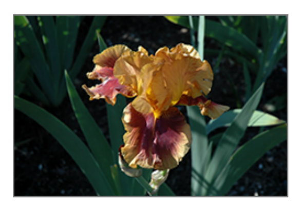
Apollodorus Iris flowers