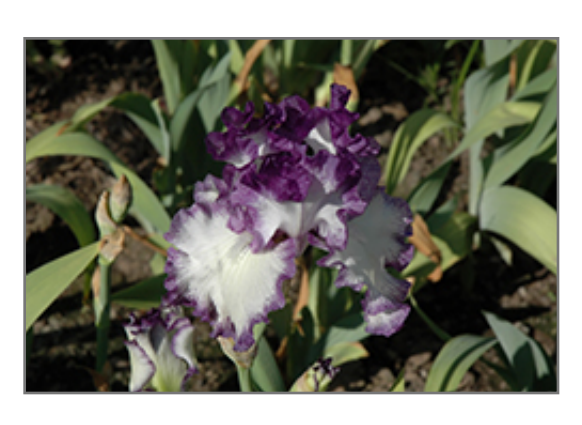
American Classic Iris flowers

This vibrant iris produces ruffled white blooms with thick, deep blue-violet plicata edges giving sharp color contrast; a stunning addition to the perennial border; also excellent massed in groupings in the garden; extraordinary, multiple bloom habit