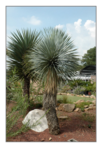
Beaked Yucca (tree form)

A succulent cactus-like tree with beautiful blue-green spear-like leaves radiating from the center and tall spikes of nodding white flowers in autumn; once established, this variety is trunk forming; good for dry sites, use as a focal accent