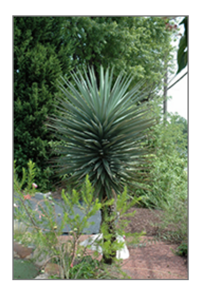
Spanish Bayonet (tree form)