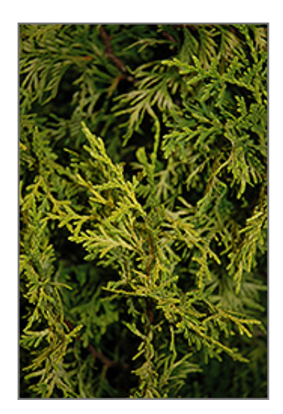
Golden Feather Arborvitae foliage

Golden Feather Arborvitae will grow to be about 30 feet tall at maturity, with a spread of 15 feet. It has a low canopy with a typical clearance of 2 feet from the ground, and should not be planted underneath power lines. It grows at a slow rate, and under ideal conditions can be expected to live for 80 years or more.