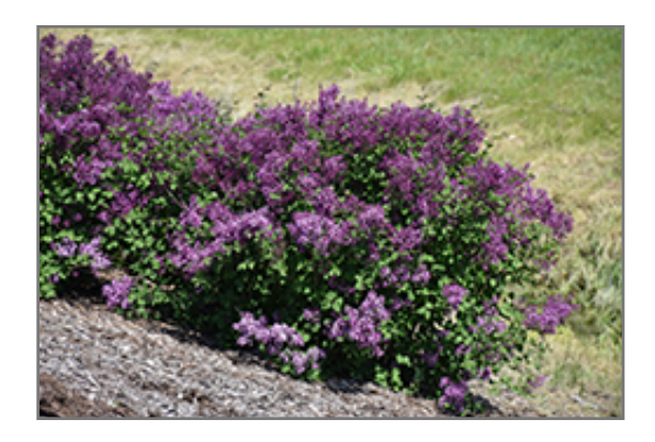
Bloomerang Dark Purple Lilac in bloom

Bloomerang Dark Purple Lilac is recommended for the following landscape applications;