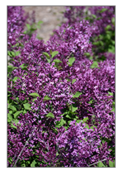
Bloomerang Dark Purple Lilac flowers

This is a relatively low maintenance shrub, and should only be pruned after flowering to avoid removing any of the current season's flowers. It is a good choice for attracting butterflies to your yard. It has no significant negative characteristics.