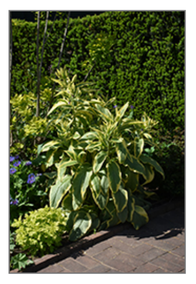
Axminster Gold Russian Comfrey