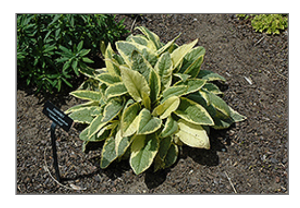
Axminster Gold Russian Comfrey

Axminster Gold Russian Comfrey is recommended for the following landscape applications;