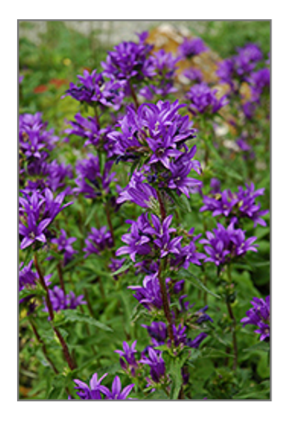
Clustered Bellflower flowers