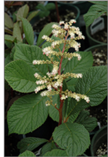
Hercules Rodgersia flowers