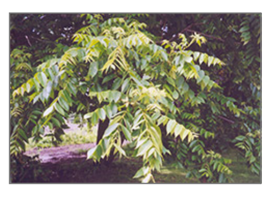
Butternut foliage