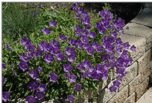
Blue Clips Bellflower in bloom