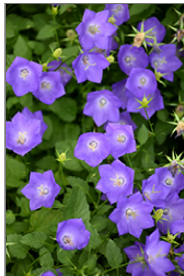
Blue Clips Bellflower flowers

Blue Clips Bellflower is recommended for the following landscape applications;