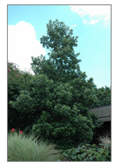
Aiken County Sweetbay Magnolia