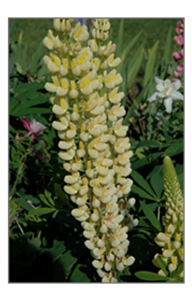
Russell Yellow Lupine flowers

A stunning hybrid producing thick spikes of eye catching flowers in tones of yellow; a tremendous visual impact massed in the garden, border plantings or in containers