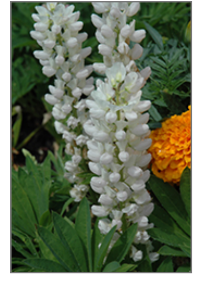
Mini Gallery White Lupine flowers

A stunning compact hybrid producing thick spikes of eye catching white flower spikes; a tremendous visual impact massed in the garden, border plantings or in containers