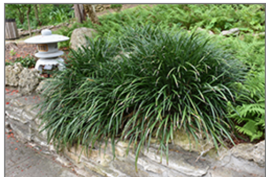
Evergreen Giant Lily Turf