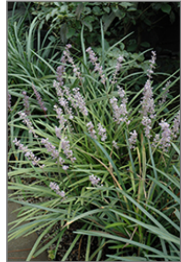
Evergreen Giant Lily Turf flowers

Evergreen Giant Lily Turf is recommended for the following landscape applications;