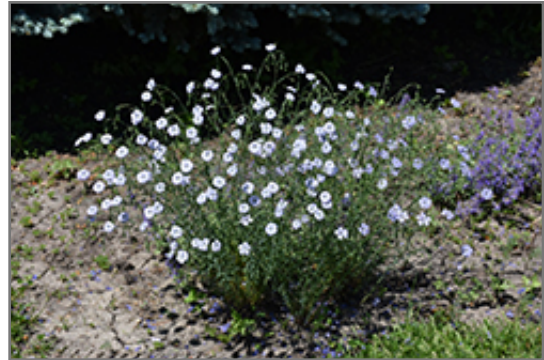
Blue Sapphire Perennial Flax in bloom

Blue Sapphire Perennial Flax is recommended for the following landscape applications;