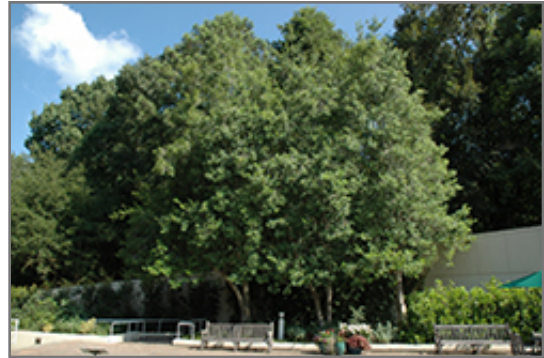
East Palatka Holly