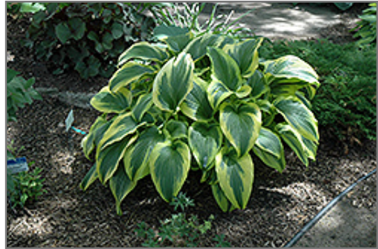
Variegated Mountain Hosta