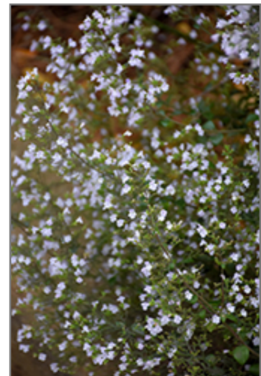
Dwarf Calamint flowers