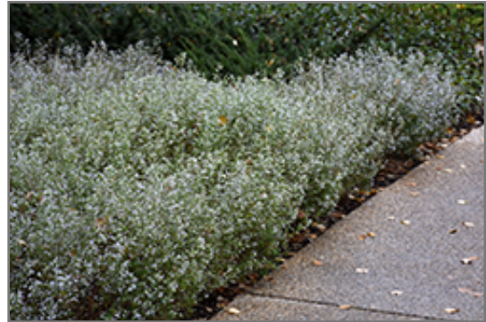
Dwarf Calamint in bloom

Dwarf Calamint is recommended for the following landscape applications;