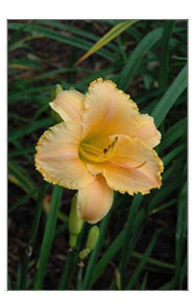
Summer Siesta Daylily flowers

Summer Siesta Daylily features bold peach trumpet-shaped flowers with chartreuse throats and buttery yellow edges at the ends of the stems in mid summer. The flowers are excellent for cutting. Its grassy leaves remain green in colour throughout the season.