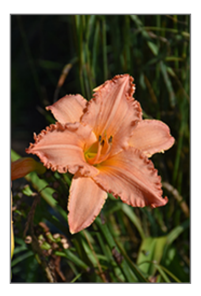
New Tangerine Twist Daylily flowers