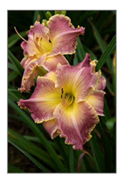
Judy Judy Daylily flowers