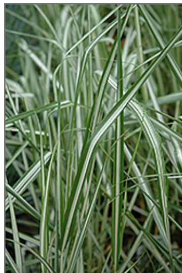
Avalanche Reed Grass foliage