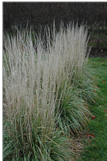
Avalanche Reed Grass in fall

Avalanche Reed Grass is recommended for the following landscape applications;