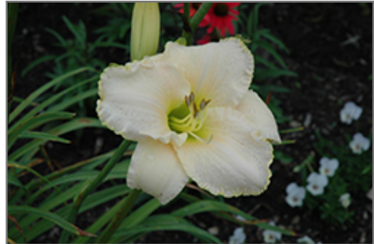
Early Snow Daylily flowers