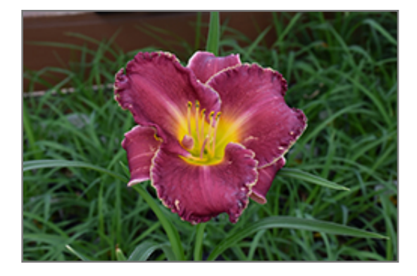
Bettylen Daylily flowers

Deep purple-red trumpets with bright yellow throats and ruffled creamy yellow edges; great grassy texture and form; tetraploid; a visually pleasing addition to the garden or border