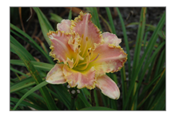
Bettylen Daylily flowers

Bettylen Daylily is an herbaceous perennial with a shapely form and gracefully arching foliage. Its medium texture blends into the garden, but can always be balanced by a couple of finer or coarser plants for an effective composition.