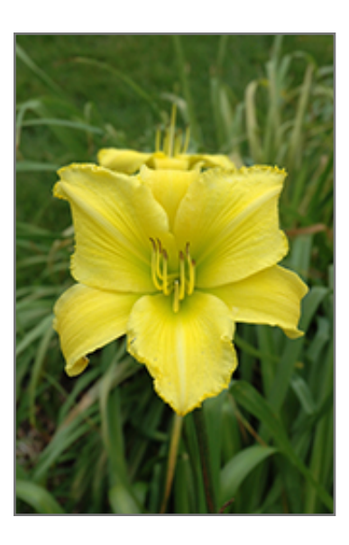
Alpha Centauri Daylily flowers

Alpha Centauri Daylily features bold lemon yellow trumpet-shaped flowers with lime green throats at the ends of the stems from mid to late summer. The flowers are excellent for cutting. Its grassy leaves remain green in colour throughout the season.