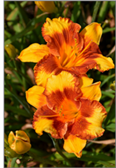
Adorable Tiger Daylily flowers