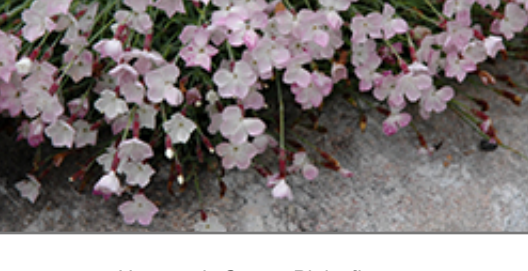
Nyewoods Cream Pinks flowers