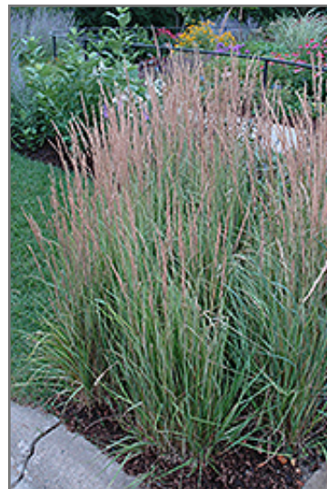
Variegated Reed Grass in bloom

Variegated Reed Grass is an herbaceous perennial grass with an upright spreading habit of growth. It brings an extremely fine and delicate texture to the garden composition and should be used to full effect.