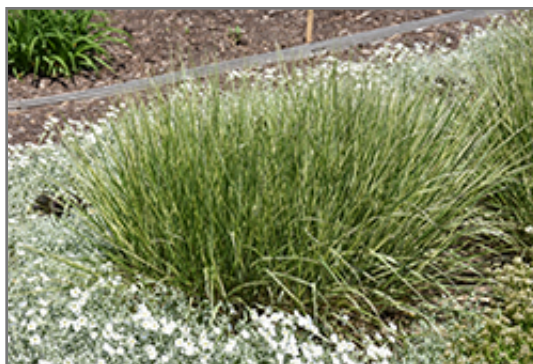
Variegated Reed Grass