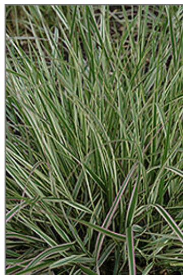
Variegated Reed Grass foliage