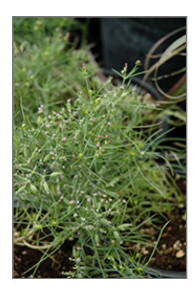
Cumin flowers

This plant is typically grown in a designated herb garden. It should only be grown in full sunlight. It is very adaptable to both dry and moist growing conditions, but will not tolerate any standing water. It is not particular as to soil type or pH. It is somewhat tolerant of urban pollution. This species is not originally from North America.