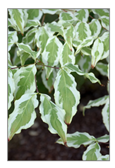
Summer Fun Chinese Dogwood foliage