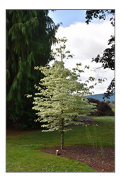
Summer Fun Chinese Dogwood