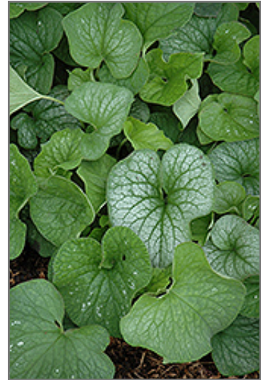
Langtrees Bugloss foliage