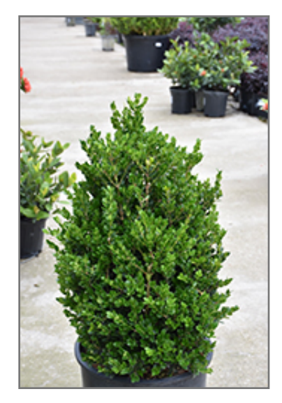
Faulkner Boxwood

Faulkner Boxwood is recommended for the following landscape applications;