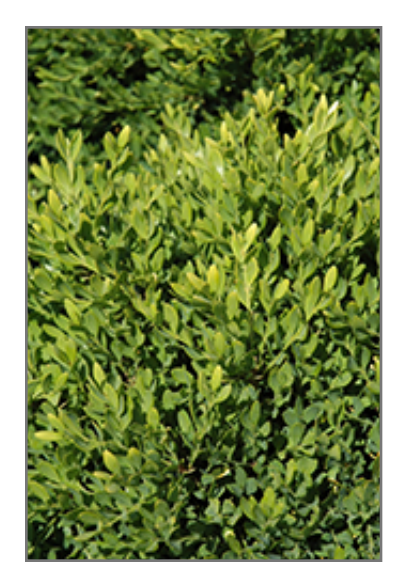
Faulkner Boxwood foliage