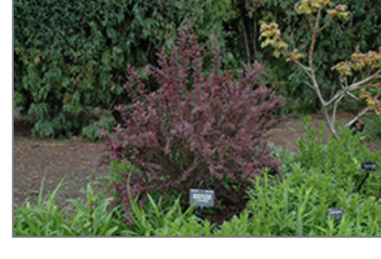
Marshall's Upright Japanese Barberry

A beautiful shrub for bringing color into the landscape; rich burgundy-red foliage all summer long, finally turning scarlet in fall, along with showy red fruits that persist after the leaves fall