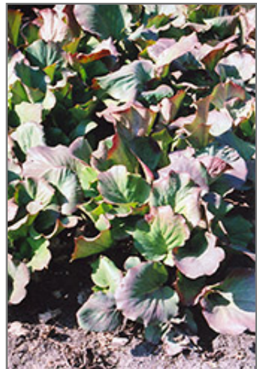
Purpleleaf Bergenia foliage