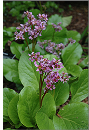
Purpleleaf Bergenia flowers