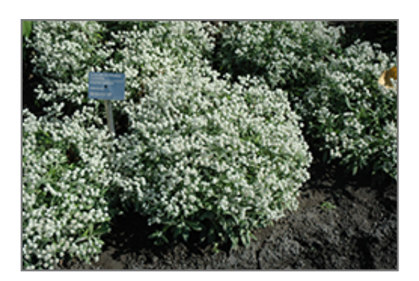
Triple-nerved Pearly Everlasting in bloom