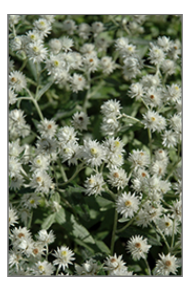
Triple-nerved Pearly Everlasting flowers

This plant will require occasional maintenance and upkeep, and should be cut back in late fall in preparation for winter. It is a good choice for attracting butterflies to your yard. Gardeners should be aware of the following characteristic(s) that may warrant special consideration;