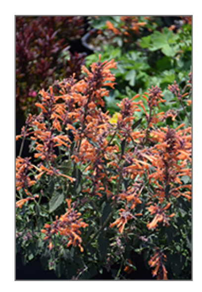
Kudos Mandarin Hyssop flowers

Kudos Mandarin Hyssop is an open herbaceous perennial with an upright spreading habit of growth. Its relatively fine texture sets it apart from other garden plants with less refined foliage.