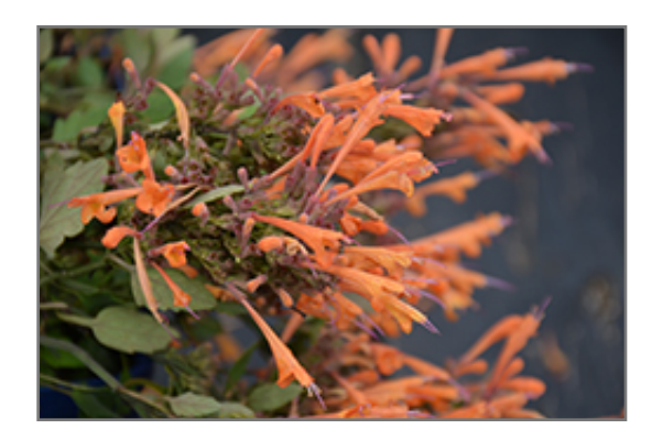
Kudos Mandarin Hyssop flowers