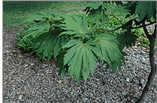
Yama Kagi Fullmoon Maple foliage